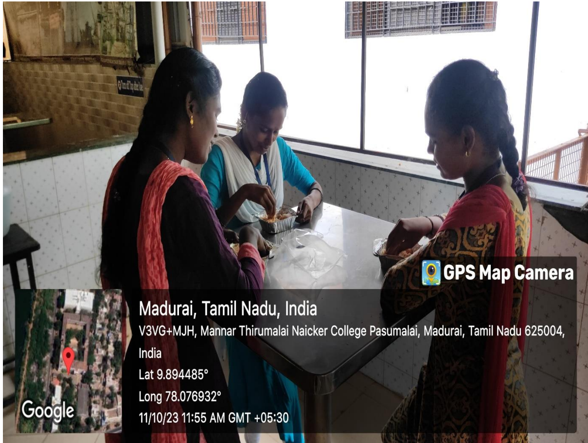
Girl Students having Mid-day Meals in the Canteen

Pasumalai, Madurai – 625 004 Tamil Nadu.