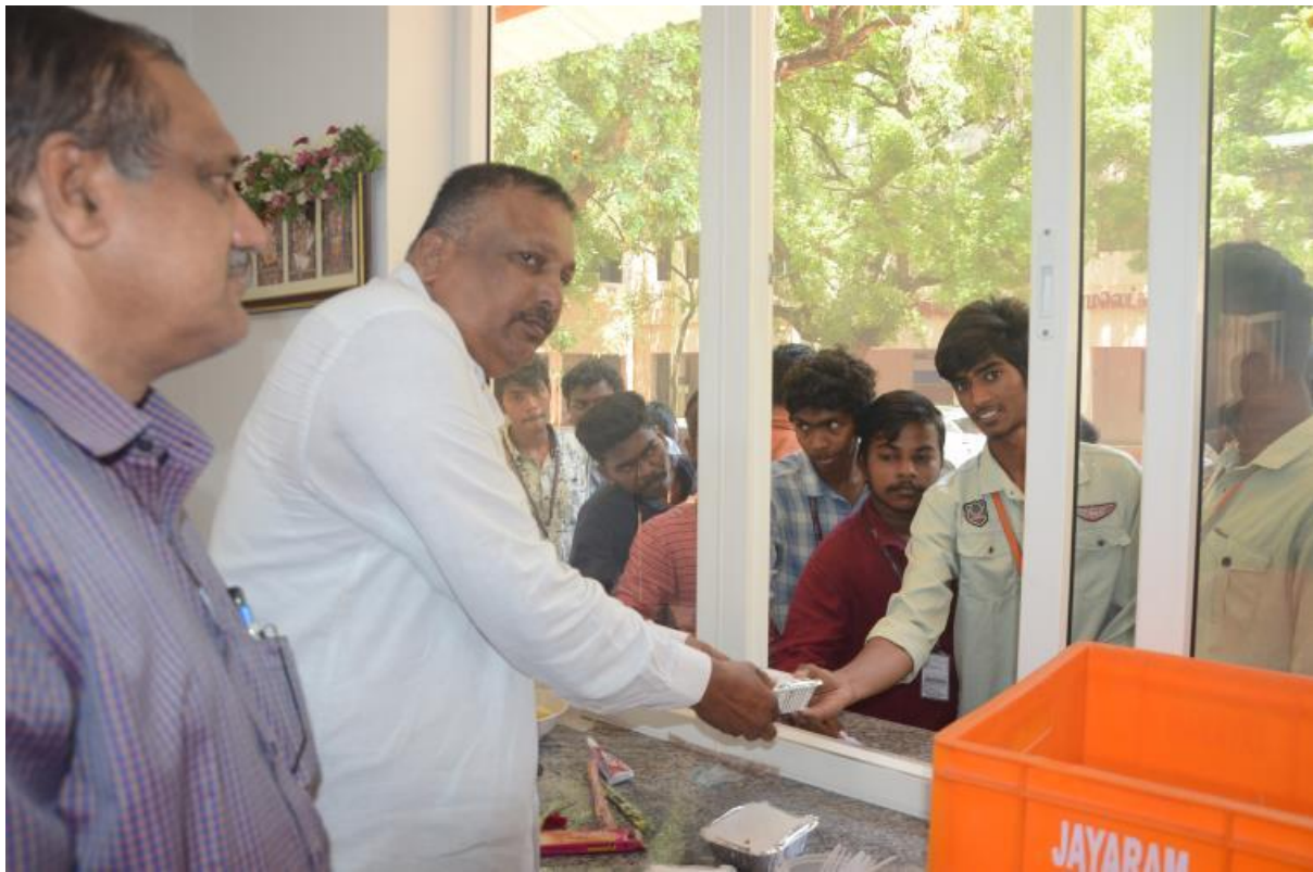
The Principal Distributes Food Packets

Pasumalai, Madurai – 625 004 Tamil Nadu.