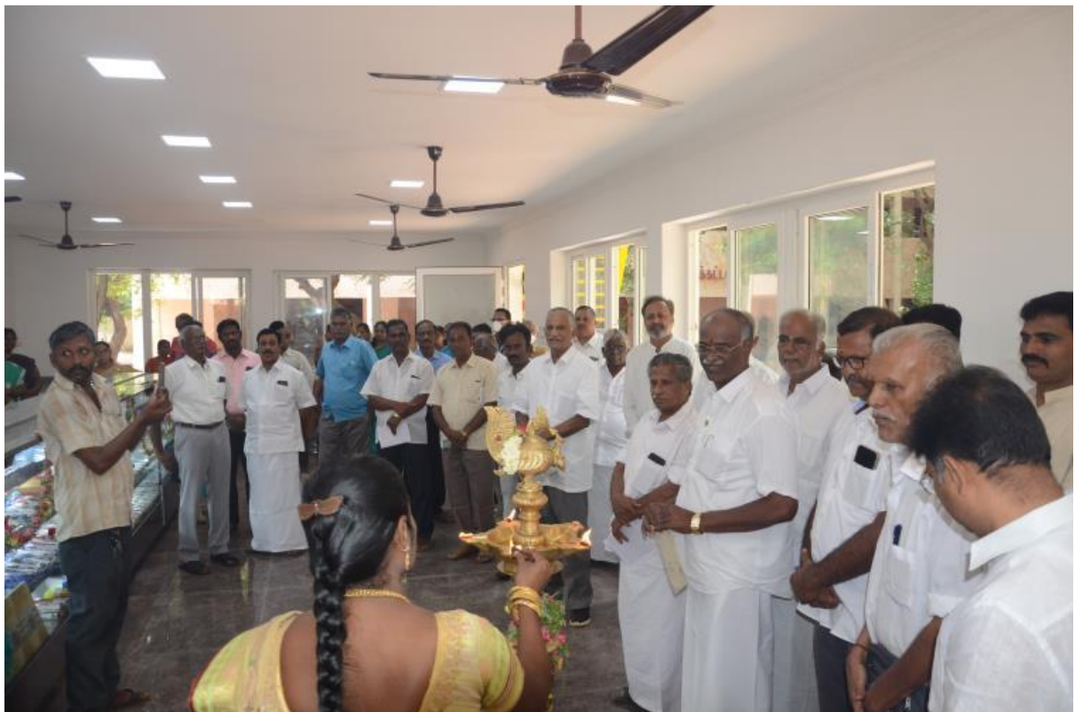
Lighting the Lamp

Pasumalai, Madurai – 625 004 Tamil Nadu.