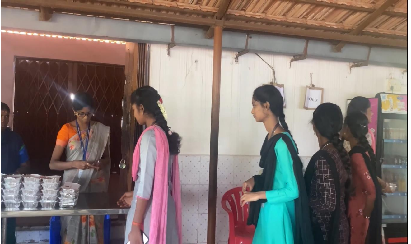
Girl Students Collecting Food Packets

Pasumalai, Madurai – 625 004 Tamil Nadu.