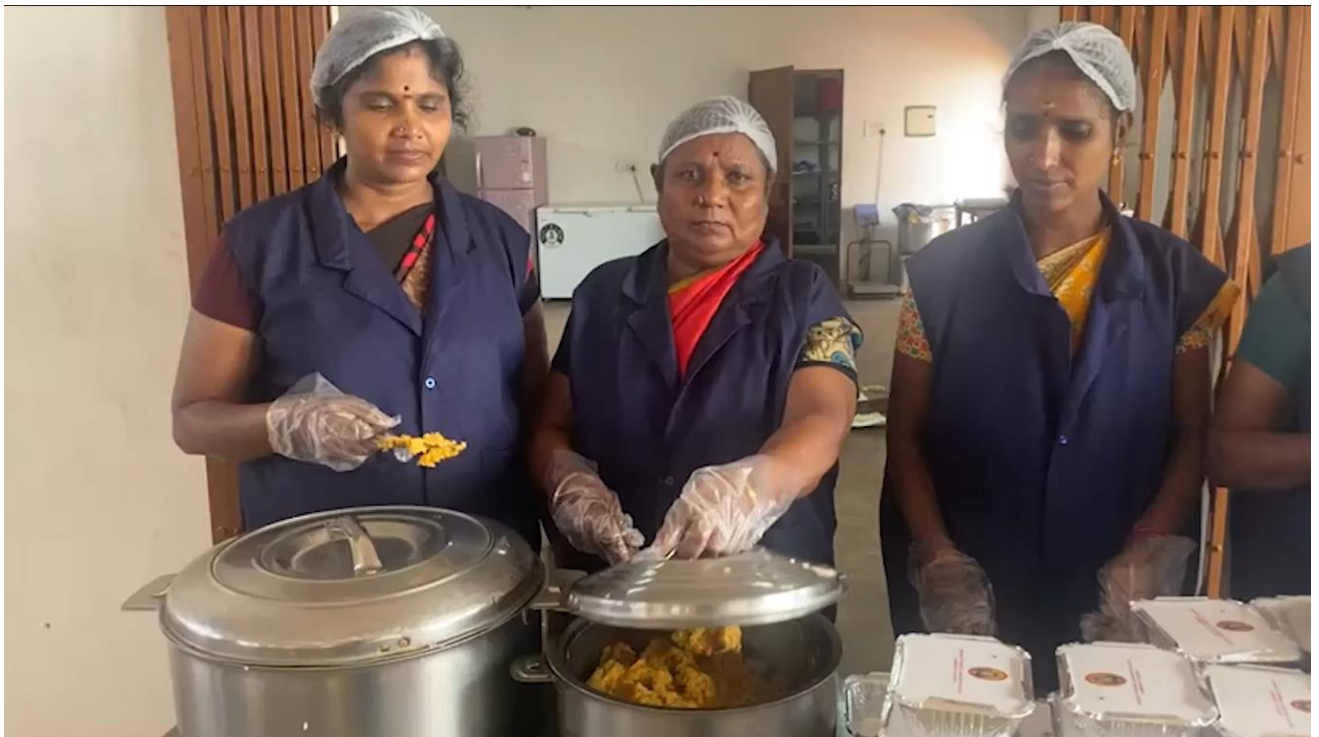
Packing Food in the Hostel

Pasumalai, Madurai – 625 004 Tamil Nadu.