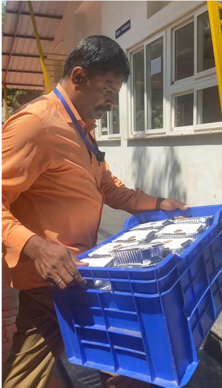
Food Packets Dispatched to Boys' Canteen

Pasumalai, Madurai – 625 004 Tamil Nadu.