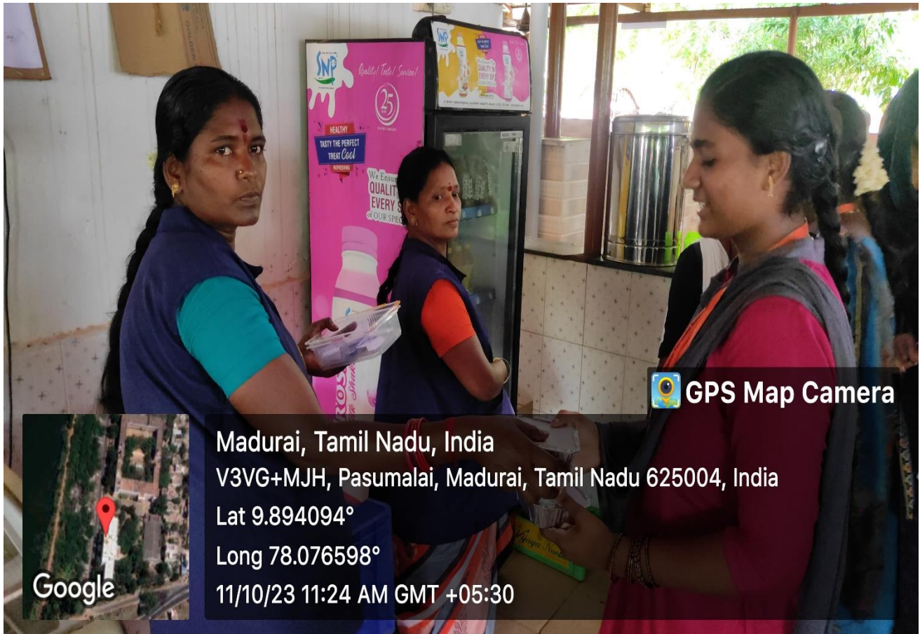
Girl Students Collecting Tokens

Pasumalai, Madurai – 625 004 Tamil Nadu.