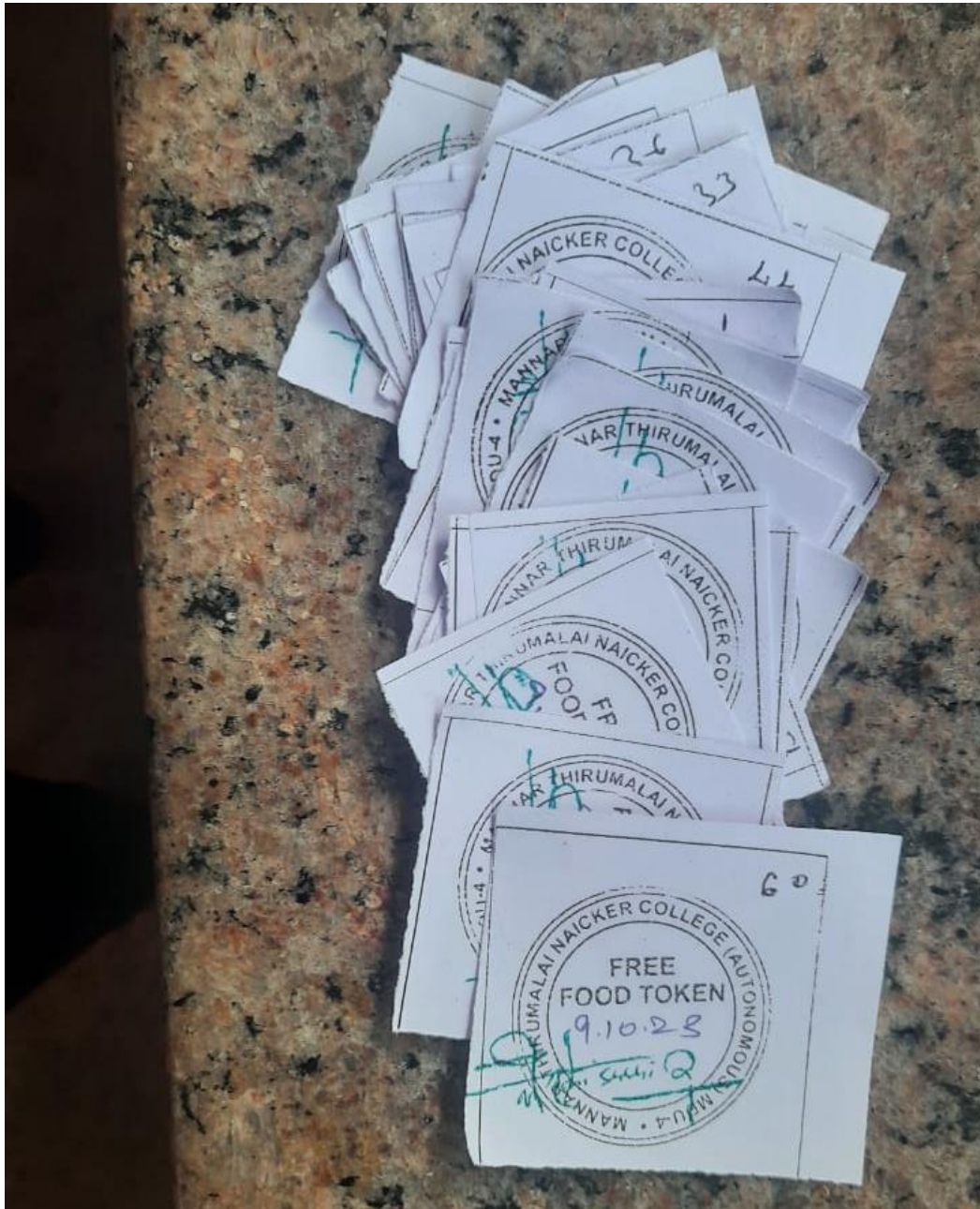
Silent Meals Tokens

Pasumalai, Madurai – 625 004 Tamil Nadu.