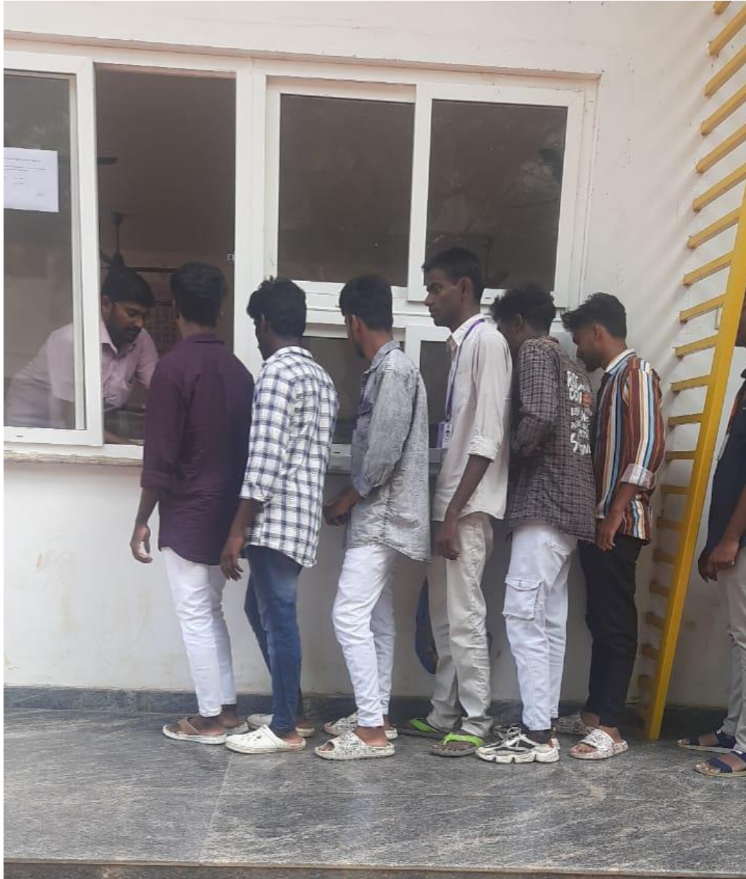
Boy Students Collecting Tokens

Pasumalai, Madurai – 625 004 Tamil Nadu.