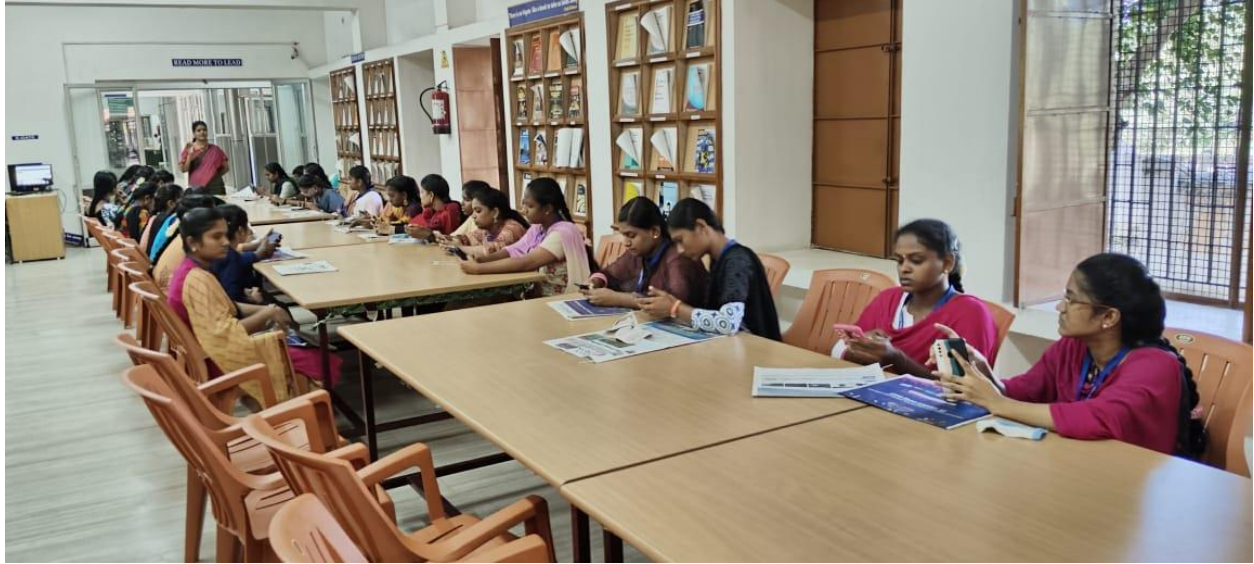
Conducted on 29/01/2024 - Essay Writing