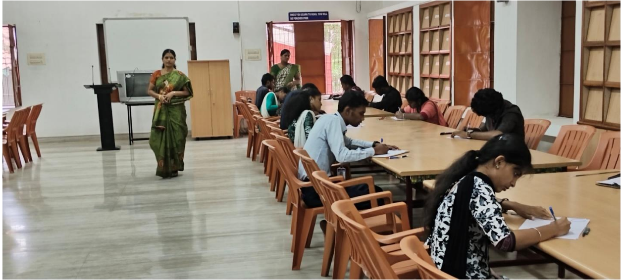
Conducted on 29/01/2024-Elocution competition