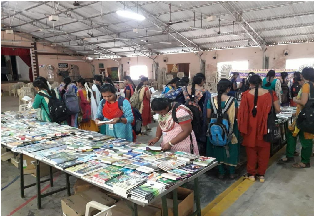
Conducted the E-Journal (N-List) Training Programme for UG & PG students from 21.10.2019 to 25.10.2019